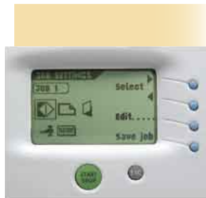
User friendly control panel