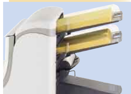
2 sheet feeders and 1 insert/BRE feeder