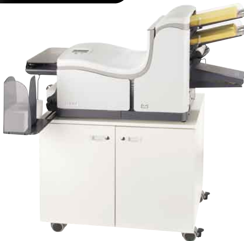
Shown with Optional Side Exit Tray and Cabinet