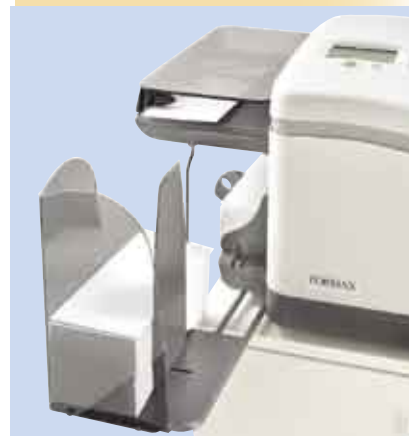
Side Exit Tray