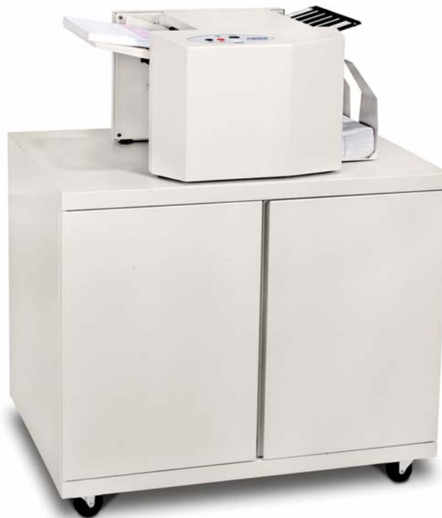
Shown with optional ca

Formax New Hampshire, USA www.formax.com