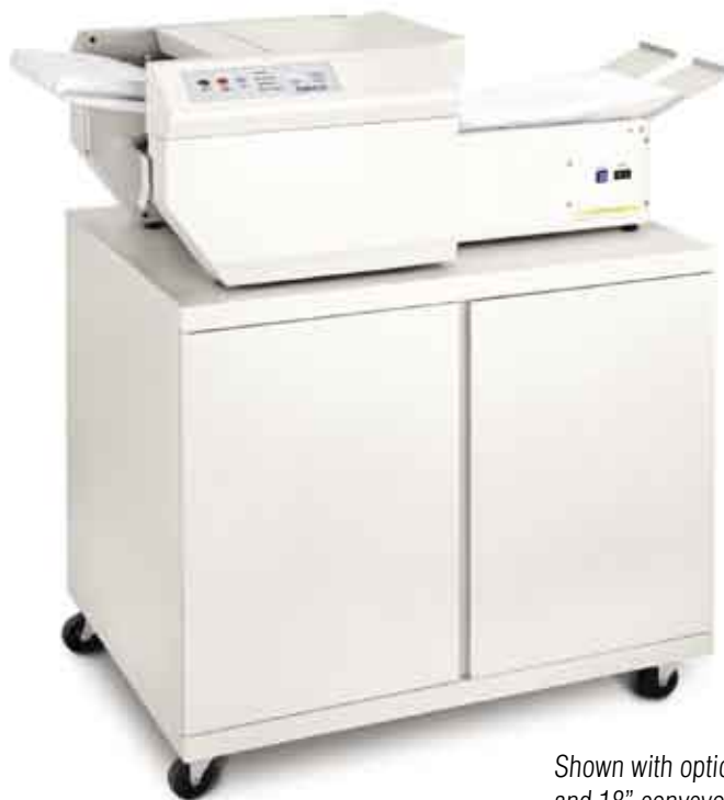
Shown with optional cabinet and 18" conveyor

The AutoSeal ® FD 2000 folder/sealer is a powerful desktop model designed to process your pressure sensitive self-mailers. An easy to use touch-pad control panel and three roller feed system makes this product both practical and dependable. Up to 150 forms can be loaded in the hopper and processed at speeds up to 7,000 per hour. The FD 2000 also comes with an optional fully enclosed cabinet for storage and a conveyor with photo-eye for neat and sequential stacking of processed forms.