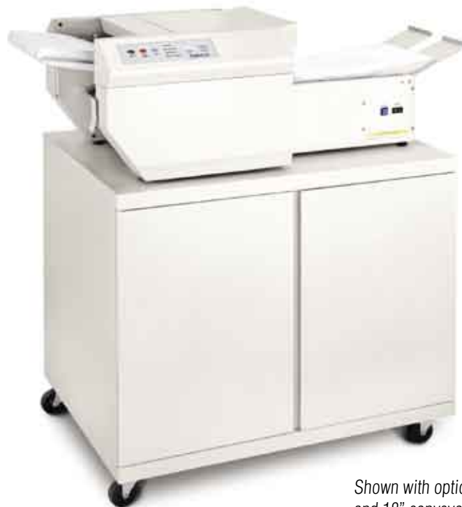
Shown with optional cabinet and 18" conveyor

The FD 2030 AutoSeal ® desktop pressure sealer provides a reliable and compact solution for processing pressure sensitive self-mailers. Standard features include a six-digit counter, jog control, fault detection, L.E.D. indicators and an operator friendly touch-pad control panel. Up to 225 forms can be loaded in the feeder and processed at speeds up to 9,000 per hour. All of these features make the FD 2030 the perfect solution for streamlining your post processing. The FD 2030 is also available with an optional fully enclosed cabinet for storage, and a choice of two conveyors with photo-eye for neat and sequential stacking of processed forms.