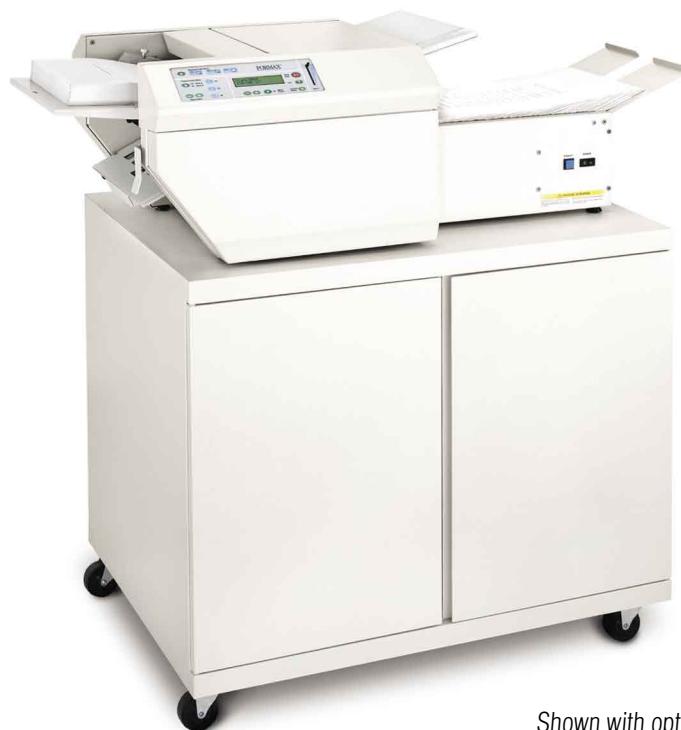
Shown with optional cabinet and 18" conveyor

The AutoSeal® FD 2052 is a fully automatic pressure sealer which provides the ultimate solution for processing pressure sensitive self-mailers. Designed with ease of operation and efficiency in mind, the FD 2052 automatically detects and adjusts for 11" and 14" (Int'l Size A4) paper sizes and is pre-programmed for three popular folds: "Z", "C" and Half. The FD 2052 also has the ability to store up to nine custom fold settings with the simple touch of a button.