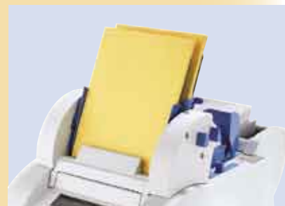
2 sheet feeders and 1 insert/BRE feeder